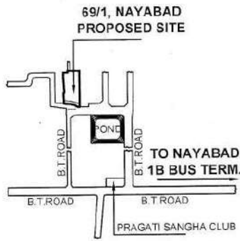
KEY PLAN SCALE:- 1:4000